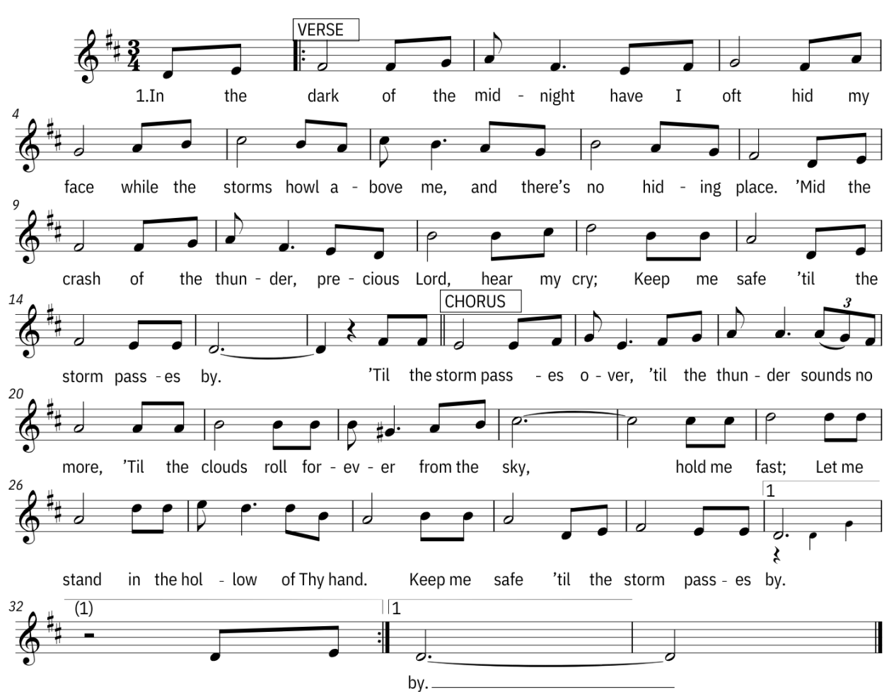
CCLI Song # 15520 © 1973 Mosie Lister Songs | Southern Faith Songs For use solely with the SongSelect® Terms of Use. All rights reserved. www.ccli.com CCLI License # 11422630